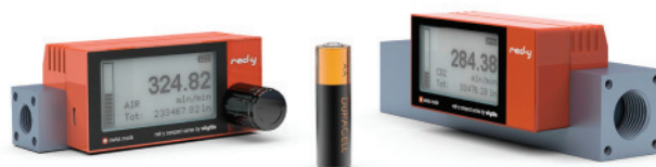
Gas consumption monitoring on USB, AA battery or 24 Vdc

These are just three of the many and extensive possibilities of the red-y compact 2 by Vögtlin. Customers around the globe make use of its advantages in the analytical field, in research and development, in light industrial applications, in semiconductor segments and other applications. Very often we hear from the users, "The beauty about the Vögtlin thermal mass