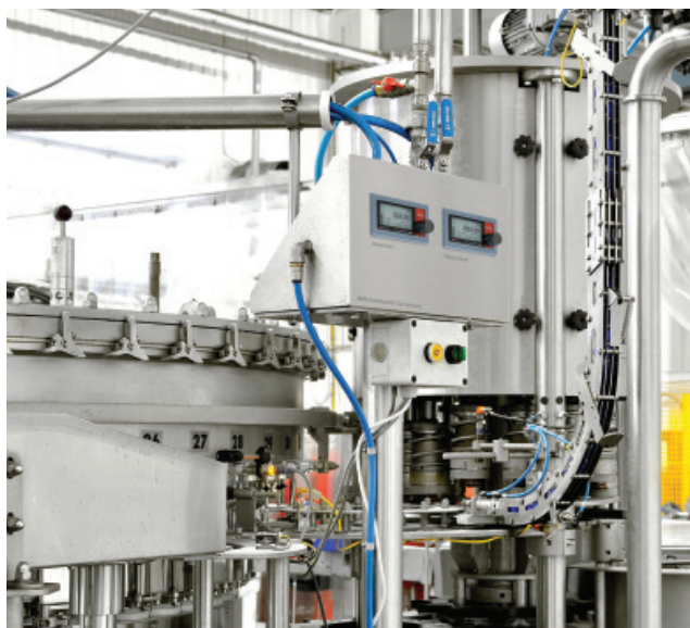
Gas sampling in the field

The Vögtlin compact 2 alarm module has three alarm points that are individually programmable for different alarm functions such as totalizer, window, high and low alarm. We will also make use of the timer functions and the ability to reset the alarms and totalizer with an I/O input on the alarm module.