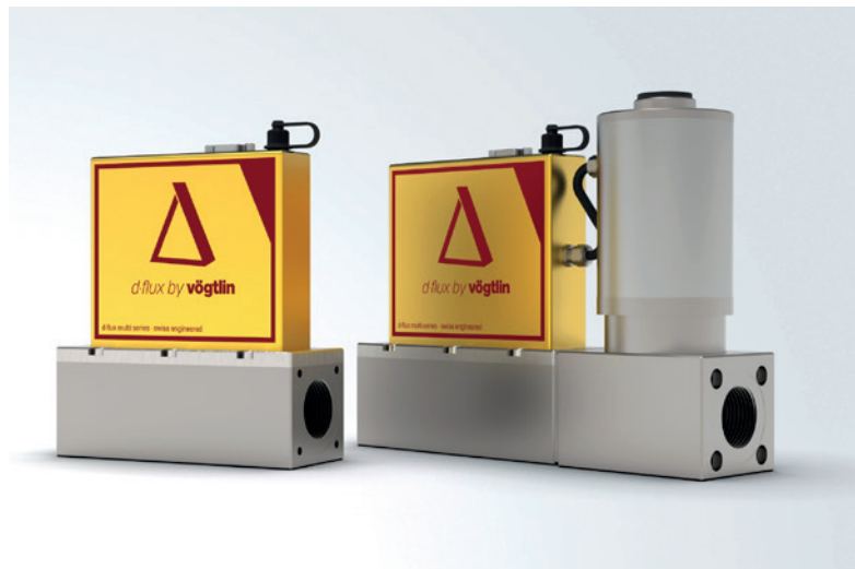
d-flux multi series mass flow meter and controller

Vögtlin can offer FKM, EPDM or FFKM elastomers for d-flux. While we try to use the best available information to select the most appropriate elastomer compound for our seals, gaskets, valve plunger depending on the gas to be used, it is ultimately the user responsibility to select the appropriate elastomer for his/her application and process conditions.