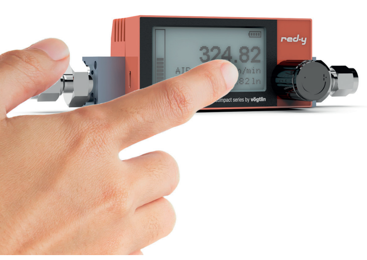
red-y compact 2 series

Automatic or manual – Vögtlin's thermal mass controllers feature high precision for the regulation of gas flow rates. When used for automatic regulation, the optimized interaction of the measuring unit and the regulating valve permits complex regulation tasks to be implemented eficiently and reliably.